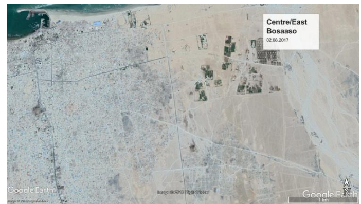
Central/Eastern Bosaaso 2017: suburbanisation through resettlement initiatives

Between 2005 and 2014, an initiative by the Bosaaso municipality and international actors, central among them UN Habitat, resettled around 1700 households to land at the eastern edge of the city, beyond a new bypass road. Based on an incremental tenure model whereby beneficiaries gain full ownership of the land/property after continuous residence for 15 years, the settlers were provided permanent (stone) or semi-permanent (corrugated metal) houses. A new set of neighbourhoods has emerged at the eastern edge of the city. The new settlements are linked to the city by the bypass road and physical and social infrastructure. Police stations, health centres, schools and mosque, were constructed for what evolved into a cluster of suburban neighbourhoods – or a satellite town in itself.