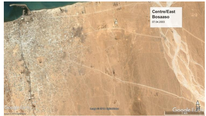
Central/Eastern Bosaaso 2003

of the city and the eastwards expansion of housing, largely made up of resettlements.