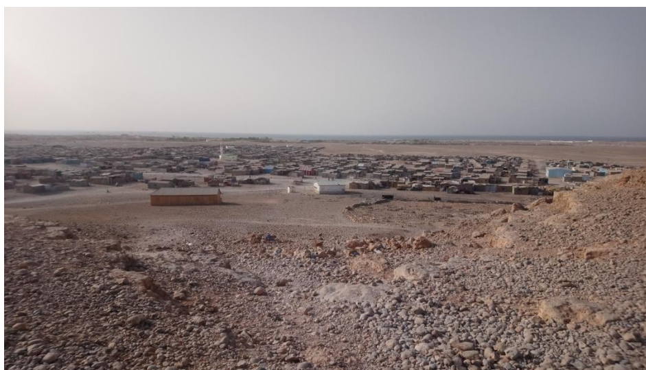
Resettlement area; Photo taken by Nuuraw in Bosaaso

(March 2019) This research brief summarises key findings from the 2017-2019 Security on the Move research project. Funded by DFID and ESRC, Security on the Move focused on the perspectives and experiences of displaced people who have settled in four Somali cities: Baidoa, Bosaaso, Hargeisa and Mogadishu. These four cities fall under different political administrations, but share two core characteristics: First, they are growing rapidly in terms of size and density, and second, an important driver of this growth is large scale in-migration caused by forced displacements. Although many issues relating to the economic and social precarity of displaced people are shared across the cities, there are important differences in regard to the historical experiences of ‘camp urbanisation’ and local and international efforts to manage patterns of settlement. This research brief focuses on the experiences of displaced people in the port city of Bosaaso, commercial capital of the Puntland State of Somalia.